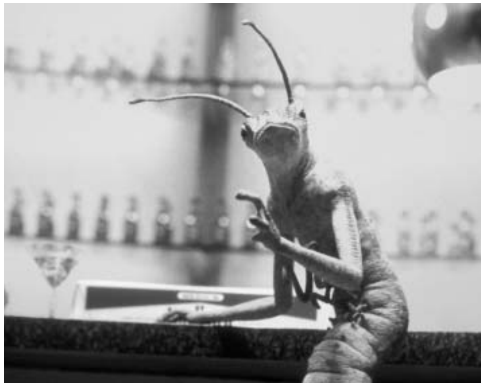
LIKE SUPERMAN II, MEN IN BLACK II (PG13) is a comic book-based blockbuster flashing Marlboros, the #1 brand among younger smokers. The alien sidekick shown with a Marlboro carton in this studio publicity photo will be sold as a doll, recommended for "8 years and up." MIIIB director Barry Sonnenfeld also featured Marlboros in Men in Black (1997). How much is this franchise worth to Philip Morris?

Yet Hollywood keeps cranking out G, PG and PG13 fare that promotes smoking and specific tobacco brands. It looks just