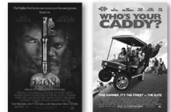
NATIONAL RELEASES 1408 (PG-13) and Who's Your Caddy (PG-13) featured fifty or more tobacco incidents, but no MPAA tobacco descriptors.

YOU DECIDE. Youth-rated films with smoking, rated and released "wide" in the six months after the MPAA's tobacco announcement, carried no tobacco descriptors. At the same time, films in limited release or sent to video—most from independents—were being tagged for "brief," "momentary" or "incidental" smoking.